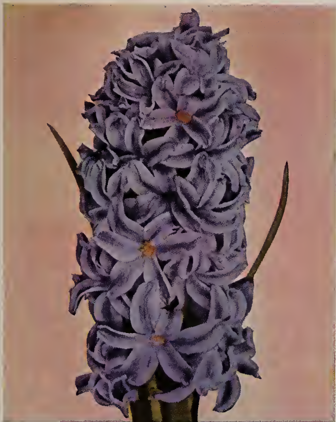
Hyacinth, Queen of the Blues

Extra sized Hyacinths recommended for Exhibition Second size for regular forcing and outdoor